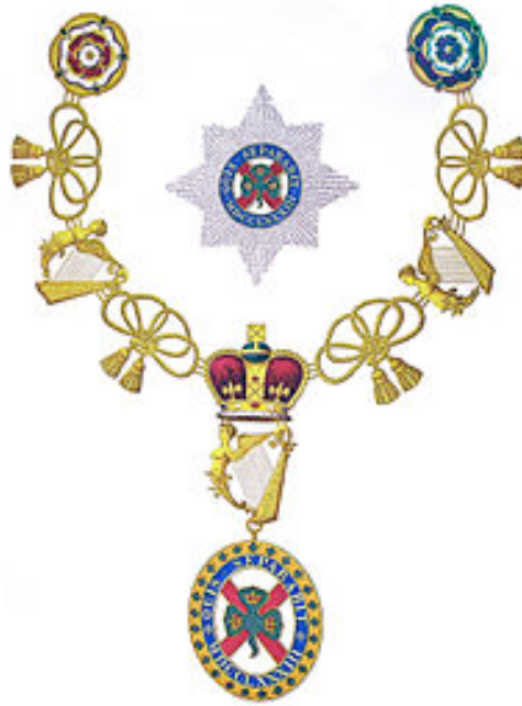
Regalia of the Knighthood of St. Patrick