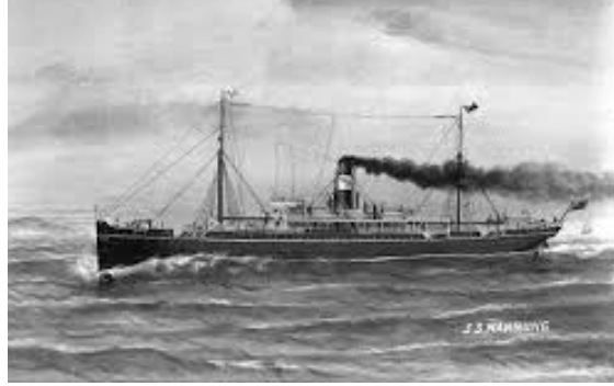
The SS Narrung