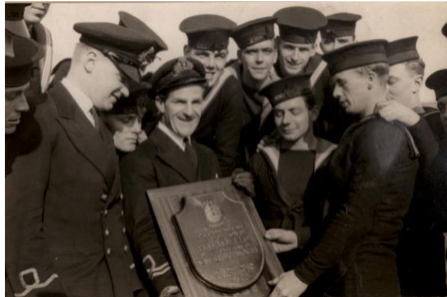
Another more relaxed pose

The precise operational history of HMML 146 is somewhat obscure. The National Archive contains very little information, possibly because it was bombed in World War 2 and much information was destroyed. However, there is still sufficient information available elsewhere to give some idea of the exploits of this boat.