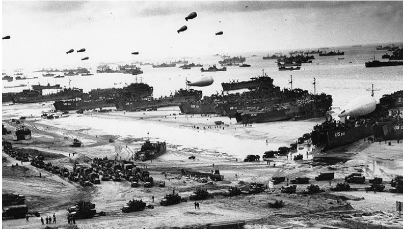
Normandy beachhead June 1944 showing volume of shipping involved

In June 1944 HMML 146 was definitely involved in 'Operation Neptune'. This was the naval operation supporting the D Day landings of 6 June. Her role in this operation is not known, but she was one of 6,939 vessels taking part to ensure the freedom of Europe from Nazi domination.