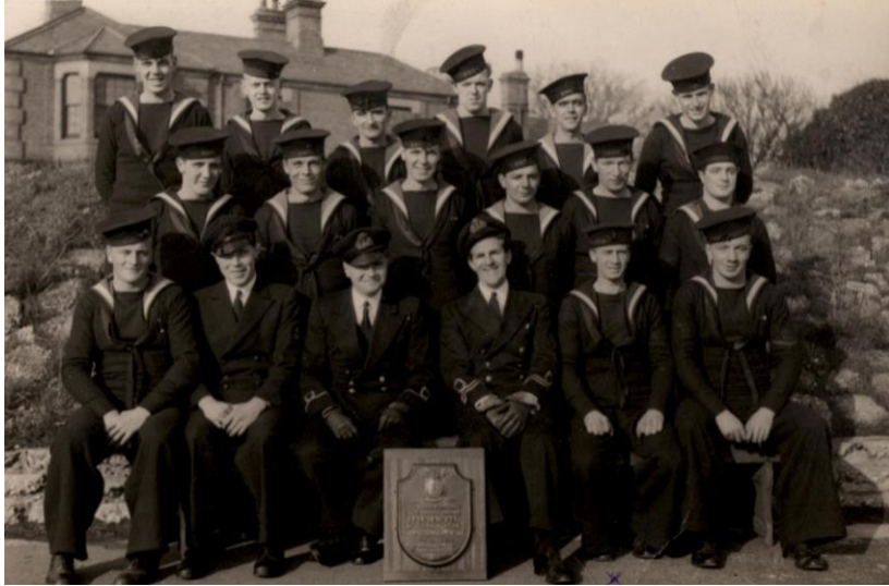
Commander and crew of HMML 146 with their Sawbridgeworth plaque