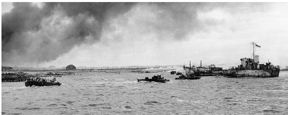
The landings at Westkapelle, 1 November 1944

On 1 November 1944, HMML 146 was once again in action. This time she was part of the naval force used for the British and Canadian landings on the island of Walcheren in the Scheldt estuary in the Netherlands. This was a successful attempt to open the port of Antwerp for Allied use. As part of 'Operation Infatuate II', HMML 146 was anchored on a dangerous shoal off the town of Westkapelle in order to mark the shoal and allow landing craft to pass safely without grounding. Furthermore, there is an unsubstantiated report that she may also have been performing ad hoc fall of shot spotting of shellfire for the 15inch gunned monitor HMS Roberts. Although this was not normal practice, other examples of this type of action have been reported from elsewhere, so it is far from impossible. It was during this action that HMML 146 was hit by a German shell. This destroyed the bridge, killing the captain, Lieutenant Commander C Cookson and three others, forcing the boat to retire from battle. To illustrate the ferocity of the German resistance to the landings at Westkapelle it is interesting to note that of the 27 small craft used in the Support Squadron, 9 were sunk and 11 damaged.