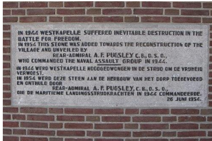
Commemorative plaque from Westkapelle

Following the Westkapelle landings, nothing more is known of the active service of HMML 146. However, presumably she was repaired because she remained on the active list.