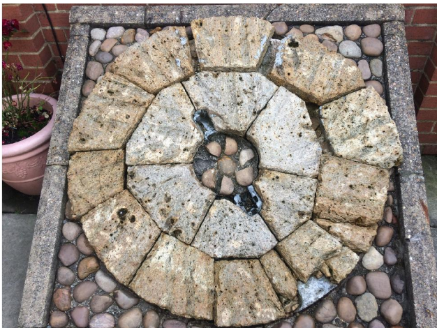
Millstone from Burton's (Sawbridgeworth) Mill displayed in Bakers Walk.

I have looked at some of those mills local to Sawbridgeworth and produced a short history of each one. I have selected just 8 mills for this project, however, strictly speaking, 7 of these no longer exist, (although 3 still retain some associated buildings). The exact location of 4 of them is unknown! It is only at Little Hallingbury that we find a complete mill building. This is not to say though that everything has disappeared. Even a short walk around Sawbridgeworth reveals the impact of the local mills. In Bell Street, you can see the remains of malthouse buildings and towards the river and the station you cannot fail to see them. The economy here was centred upon milling and some of Sawbridgeworth's richest families were to make their money in this business. It can come as no surprise therefore that the richer milling families of Barnard, De'Ath and Pavitt were related by marriage, keeping it in the family as it were.