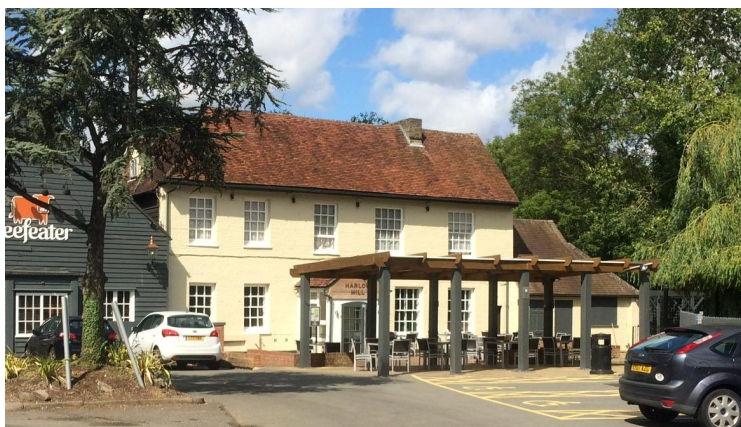
Harlow Mill in 2017.

In 1938 just prior to WW2 there is a major fire at the mill. Most of the mill itself was destroyed, and over the next few years the remaining machinery was dismantled and the mill building demolished. The mill house though survived almost intact and in 1978 this was renovated and opened as the Beefeater restaurant with a modern Premier Inn attached at the rear. This is a Grade II listed building, English Heritage ID 119438 and is reckoned to be 17 th century in date.