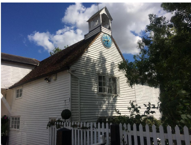
The Old Grain Store in 2017.

In 1975 there was a major fire at the mill, and the mill itself was destroyed. Many of the surrounding buildings survived though and are still to be seen today including the Mill House with its mansard roof. This is a Grade II listed building, English Heritage ID 160830. Also, the Old Grain Store, another Grade II listed building and the only surviving weatherboarded building from before the fire of 1975. English Heritage ID 160831. Additionally, in Bakers Walk just off Bell Street, there survives an old millstone now preserved and exhibited, labelled as being from Burton's Mill.