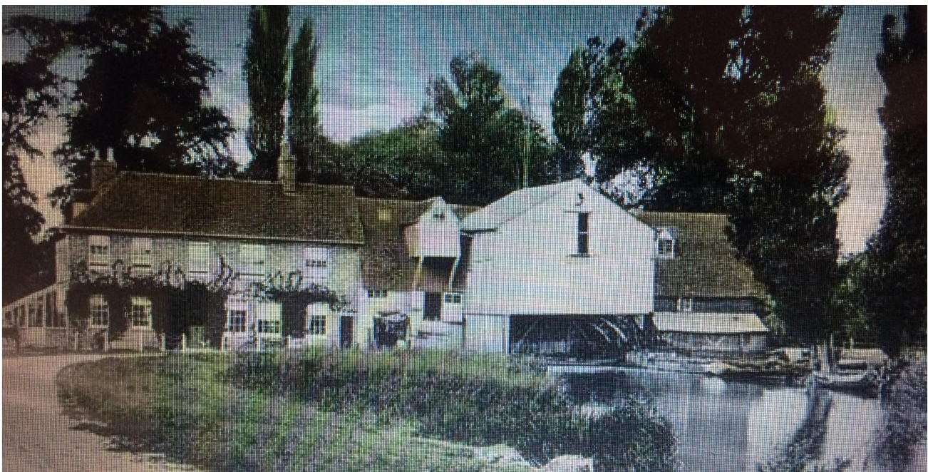
Harlow Mill c1900. The present restaurant is easily recognisable to the left of the picture. The rest of the building was destroyed by the fire of 1938.