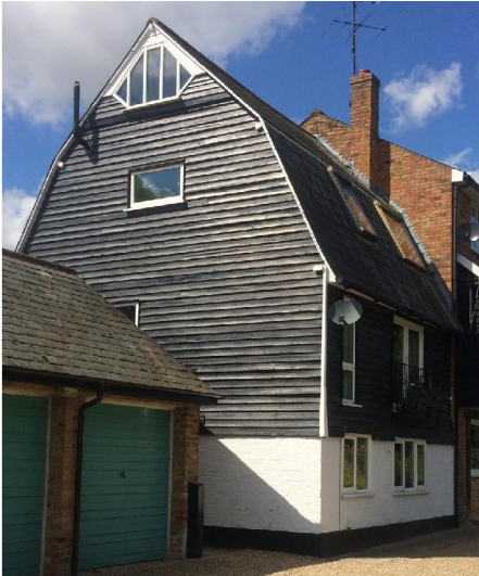
The Mill House in 2017.