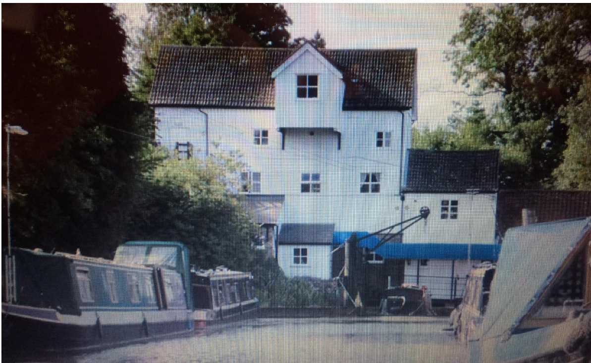
Little Hallingbury Mill viewed from the Marina.