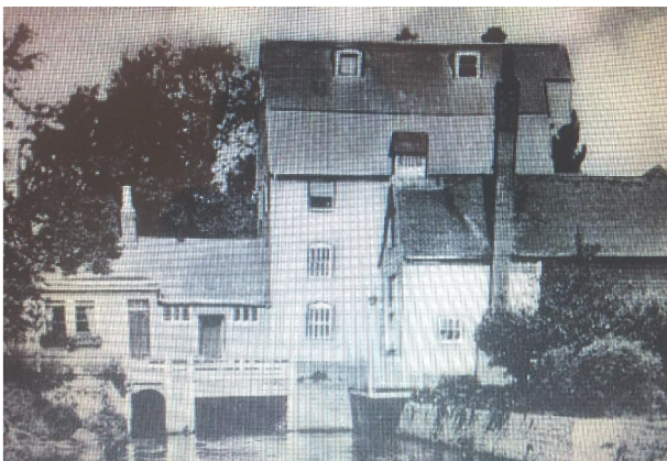
Sawbridgeworth Mill c1905.